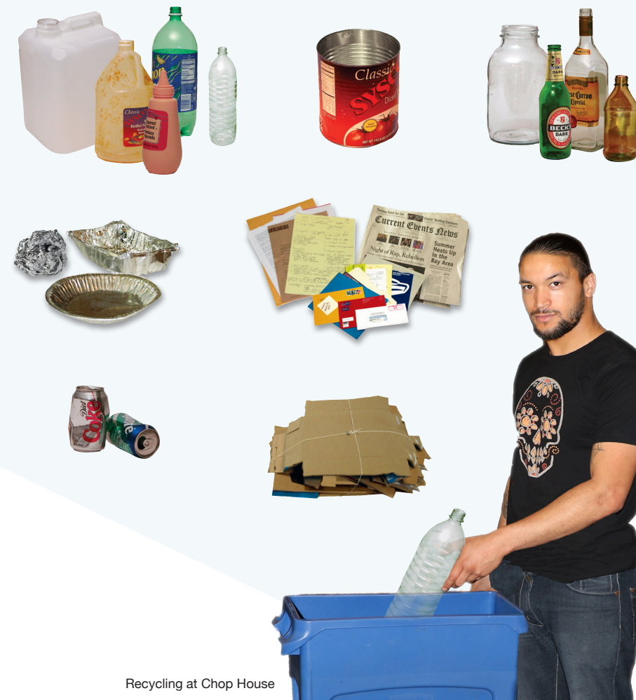
Recycling at Chop House

Recycle plastic containers, aluminum/metal food containers, cardboard, clean paper, glass food and beverage containers