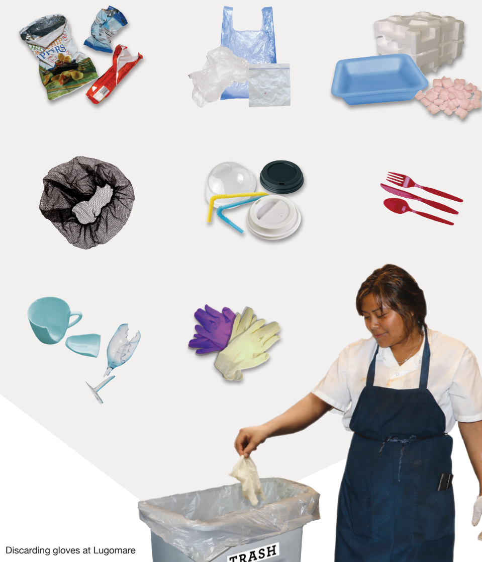
Discarding gloves at Lugomare

Non-Recyclable & Non-Hazardous Materials